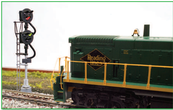
An HO Reading Lines MP15DC, approaches a "G" style, double target signal (item# 238), indicating a "Medium Clear" condition.

Multiple target signals are designed to allow modelers to incorporate most any track plan. Each signal is wired using common cathode wiring and can be incorporated into any system designed to operate with a common cathode configuration. The Atlas Model RR Signal System can be used on layouts operating on either analog (direct current), or Digital Command Control, (DCC), with a "block detector" compatible with DCC, (not available from Atlas). Digital Command Control is a method of controlling multiple trains and accessories using digital communications packets to send commands.