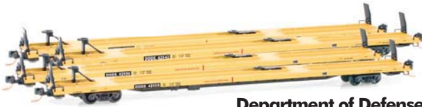
Department of Defense Rd#s: 290148, 290152, 290160, 290165 #993 00 013...$84.95