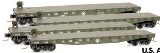
U.S. Army Rd#s: 39525, 39540, 39632, 39663 #993 00 014...$44.95