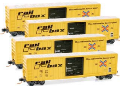
Railbox Rd#s: 17728, 17746, 17785, 17818 #993 00 015...$64.95