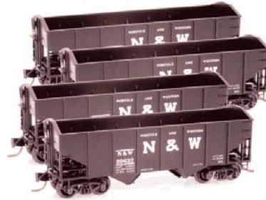
Norfolk & Western Rd#s: 39525, 39540, 39632, 39663 #993 00 012...$54.95