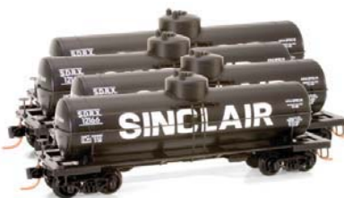
Sinclair Rd#s: 12118, 12120, 12163, 12166 #993 00 017...$64.95