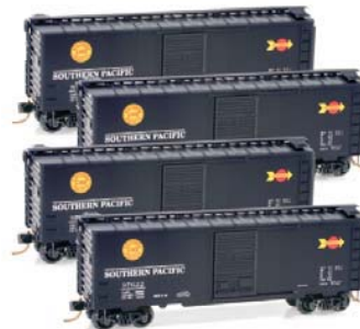
Southern Pacific® Rd#s: 97622, 97806, 97955, 98060 #993 00 016...$49.95