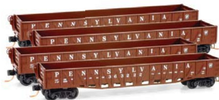
Pennsylvania Railroad Rd#s: 363222, 363236, 363300, 363305 #993 00 018...$49.95