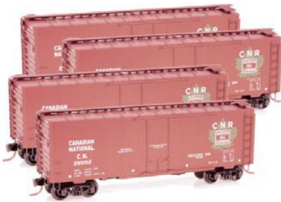
Canadian National Rd#s: 290148, 290152, 290160, 290165 #993 00 011...$54.95